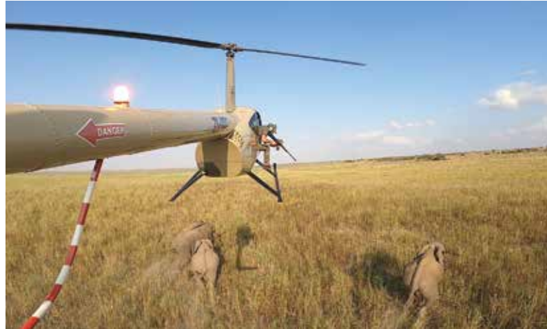
Darting an elephant for medical check and collaring.

In recent months, Bushtracks has been busy advancing conservation in Africa through several initiatives. Our latest project, "Into the WildLIFE ," offers a new type of expedition that allows travelers to immerse themselves in a specific geographic area and make a positive impact through tourism. These trips focus on protected areas in diverse destinations, stitched together by private air, with unique opportunities to go behind the scenes and learn first-hand about ongoing efforts in wildlife conservation and restoration of ecosystems. "Into the WildLIFE " takes our travelers beyond simply viewing wildlife from a safari vehicle to provide a deeper, more conscious look at these magical places and what it takes to preserve them.